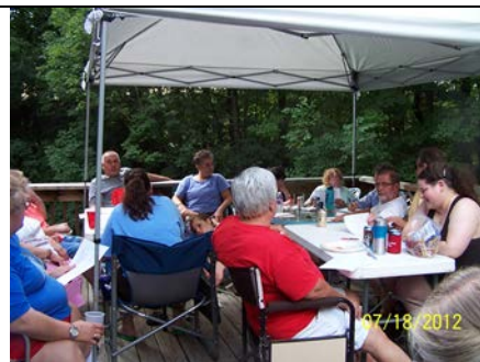
Nice crowd on the porch