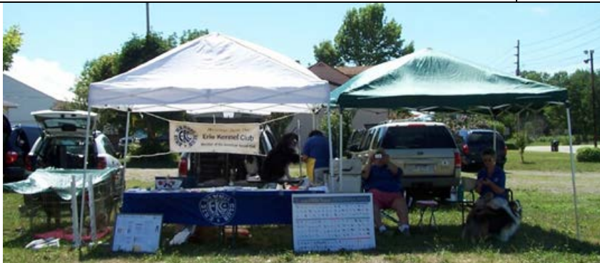
Setup at Pet Cremations Pet Appreciation Day